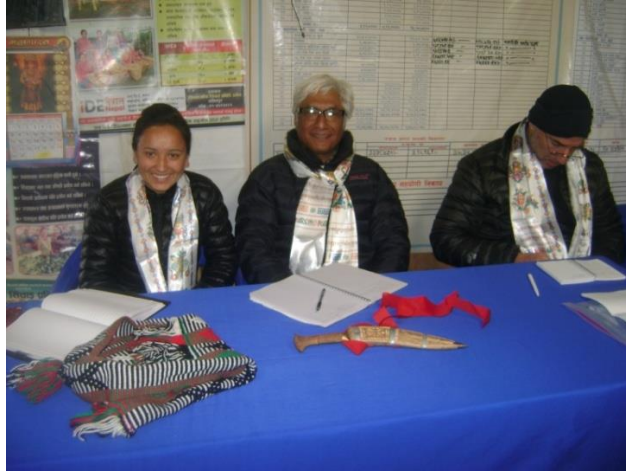
D2N Meeting with Creative Porters Society in Rakha Bangdel