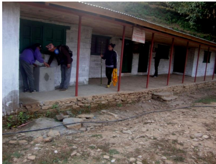
Newly built Dipsung Sub-health Post with the financial support of D2N