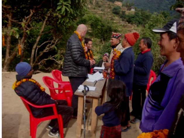
Meeting D2N with Nava Jyoti Youth Society in Dipsung